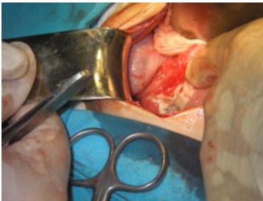
Figure 2. View of the right lower quadrant during surgery.