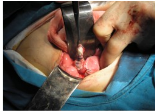
Figure 3: Panoramic view of the perforated appendicitis during surgery.