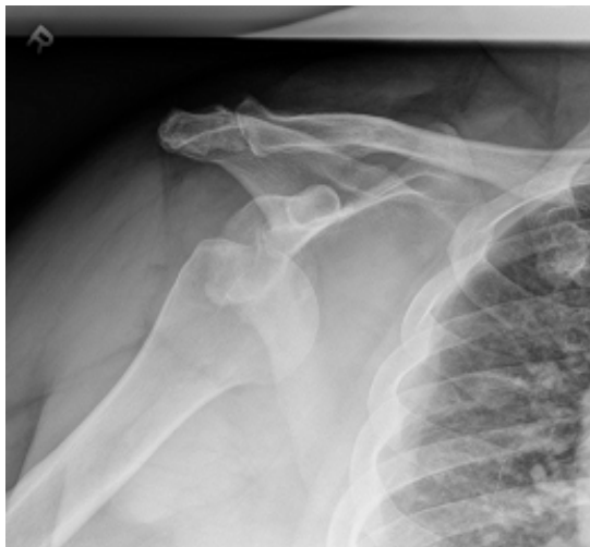
Figure 1: Prereduction anteroposterior view of the dislocated right shoulder.

Past medical history revealed that the man had been treated in the ED 7 days previously for right traumatic ASD caused by a fall from a bicycle. Prereduction imaging study showed the dislocation (Figure 1); findings on the postreduction views were interpreted as normal. Treatment consisted of analgesic medication and immobilization of the shoulder in adduction and internal rotation. The chart does not mention any residual deficits or complications from the dislocation or reduction. He was followed 5 days later by an orthopedic surgeon who prescribed conservative management with progressive physiotherapy.