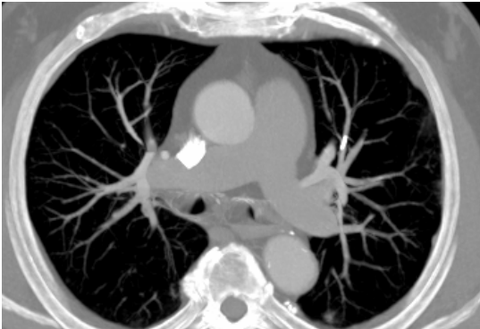
Figure 3: CT scan showing the solitary cement-embolus in the left pulmonary artery.