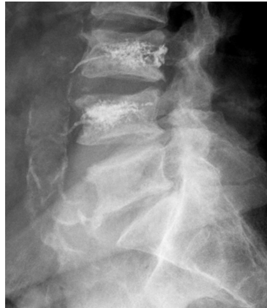
Figure 1: X-ray film of the lumbar spine showing cement leakage after vertebroplasty.

145/80 mmHg, pulse 70 beats/min. Arterial blood gas analysis yielded almost normal values: partial arterial oxygen tension (PaO 2 ) 10.6 kPa and partial pressure of carbon dioxide (PaCO 2 ) 4.5 kPa. Findings on blood chemistry analysis, including levels of C-reactive protein, troponin, myoglobin, and brain natriuretic peptide, were within normal range. The electrocardiogram showed sinus rhythm with no signs of right heart failure or strain and normal repolarization. X-ray films of the lumbar spine revealed cement leakage into the anterior venous plexus (Fig. 1). Emergency chest x-ray showed a structure of mineral density in the area of the left pulmonary artery, suggesting cement embolism (Fig.2).